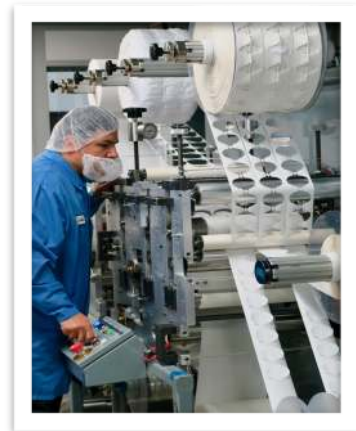
ISO 8 Cleanroom Manufacturing & Packaging